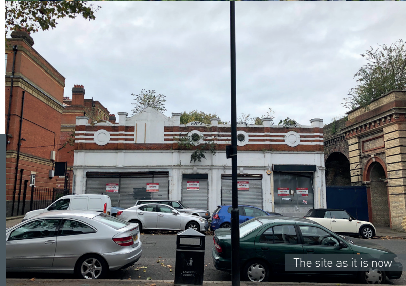
The site as it is now