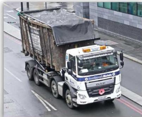
Southwark Metals' lorries